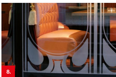
Example 8 ORACAL® 8810