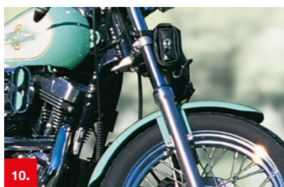
Example 10 ORACAL® 383

The RapidAir ®-Technology of the ORALITE® 5650RA material enables easy and quick application reducing the incidence of bubbles and creases, especially of large-sized applications.