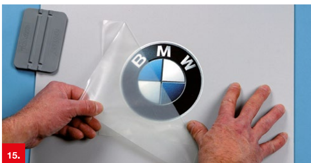
Example 15 ORATAPE® MT95

ORAFOL has developed application materials for a great variety of demands and uses.