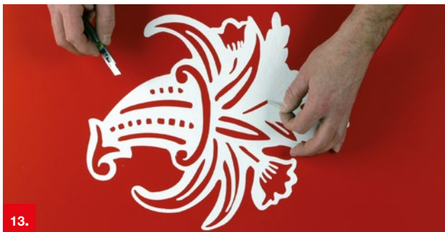
Example 13 ORAMASK® 810

These special purpose PVC films which are 230 and 350 micron thick are designed for a wide range of applications in stonemasonry and artistic sandblasting studios. They are ideal for sandblasting of glass, plastics and wood.