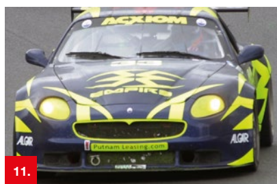
Example 11 ORACAL® 7510