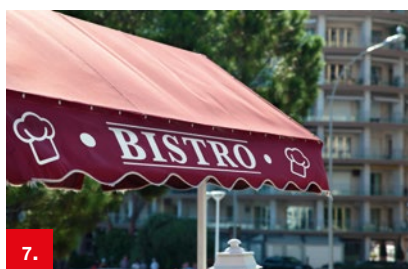
Example 7 ORACAL® 451

The typical use of the new diffuser films is application inside light box displays, where they will ensure evenly distribution of the light, as well as prevent unwanted external visibility of the internal light sources. They provide an easy means of getting a perfect finished look to any internally lit display, and are designed for use with both LED and general light sources. The materials come in two different light transmission grades.