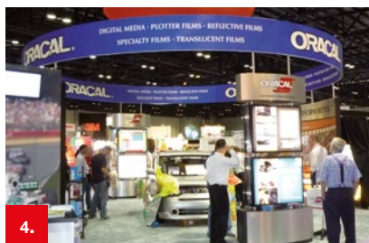
Example 4 ORACAL® 631

This plotter film is constructed specifically for use on banners, ribbons and other flexible surfaces. It adapts well to any surface, remains stable even under demanding conditions and may be easily removed without any trace. Possibilities are endless with a colour range of no less than 28 standard options.