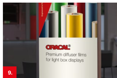
Example 9 ORACAL® 8830