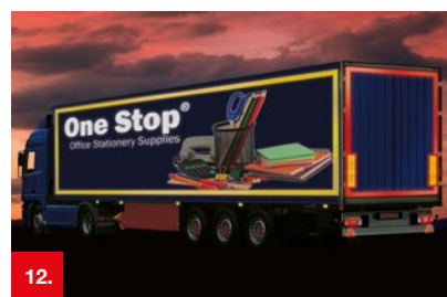
Example 12 ORALITE® 5600E