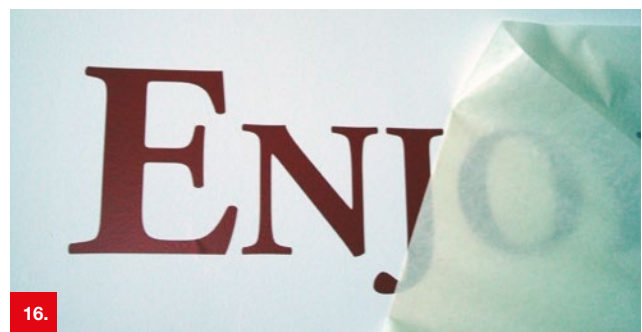
Example 16 ORATAPE® LT52