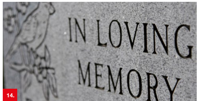
Example 14 ORAMASK® 831 / 832