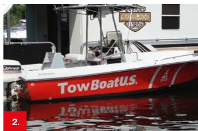
Example 2 ORACAL® 751C