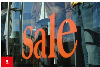
Example 5 ORACAL® 641