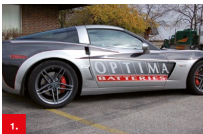
Example 1 ORACAL® 951

Designed for short and medium-term applications, this CAD/CAM vinyl can be used both indoors and outdoors. Its versatility and a range of 59 vivid colours with glossy finish and 53 colours in a matt finish makes it a perfect match for a wide range of decorative works. It displays an excellent degree of opaqueness and comes with a permanent solvent polyacrylate adhesive to allow for an outdoor durability of up to 5 years.