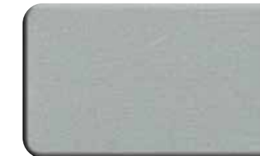
9007 Dark Grey Metallic