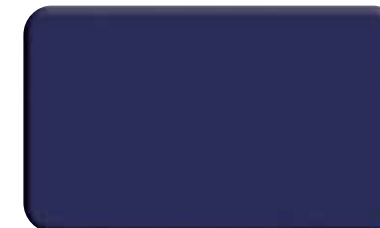
5002 Ultra Blue