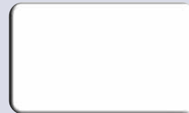
9010 Pure White

We are dedicated to the reduction of toxic emissions and strive to work to best environmental practices in everything we do. Alupanel® can be fully recycled.